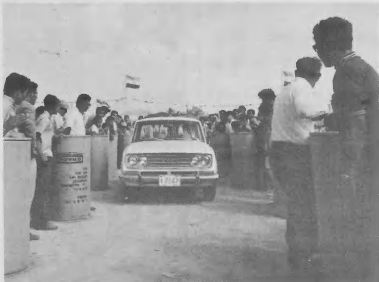
Curve driving contest - Stuur den curva.